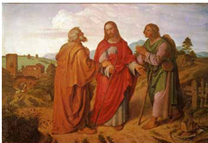
The disciples of Emmaus Joseph von Führich, 1837

With that poverty that makes one say... “Lord, I am in need, I am in need of forgiveness, I am in need of help, I am in need of strength. This poverty that we all have: making oneself poor interiorly. You have to overcome any pretense of self-sufficiency in order to understand oneself to be in need of grace, and to always be in need of Him.