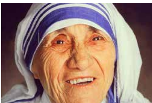
Mother Teresa of Calcutta