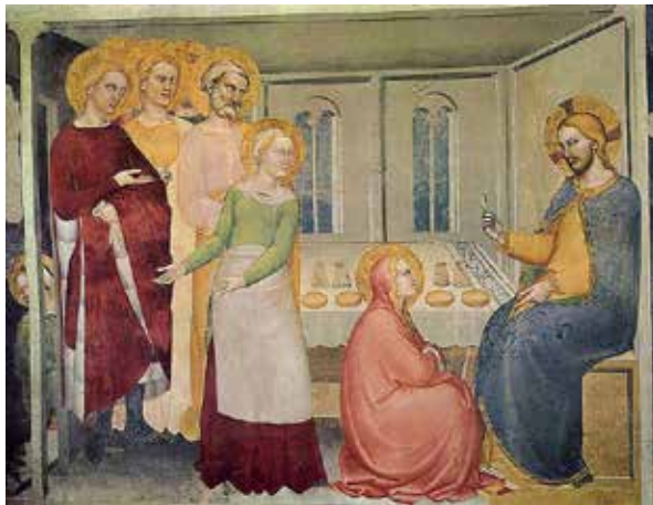
Giovanni da Milano, Christ in the house of Martha and Mary, XIV century, Santa Croce, Florence