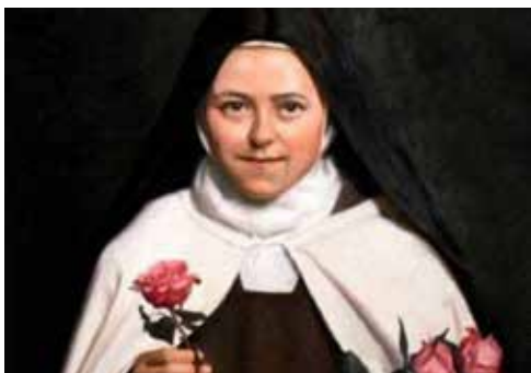
Saint Thérèse of Lisieux