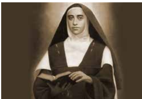
Saint Maravillas of Jesús

tell them that it is the best thing they can do! Prayer is the foundation of the mission. It is Christ who moves people's hearts. Praying for someone, intercessory prayer, is the greatest gift we can give to the one we love. We are