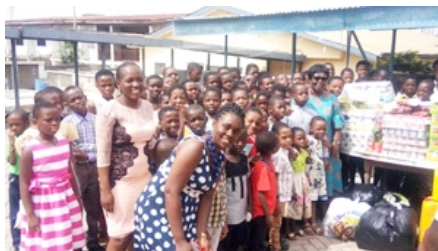
Missionary Childhood donation to needy children