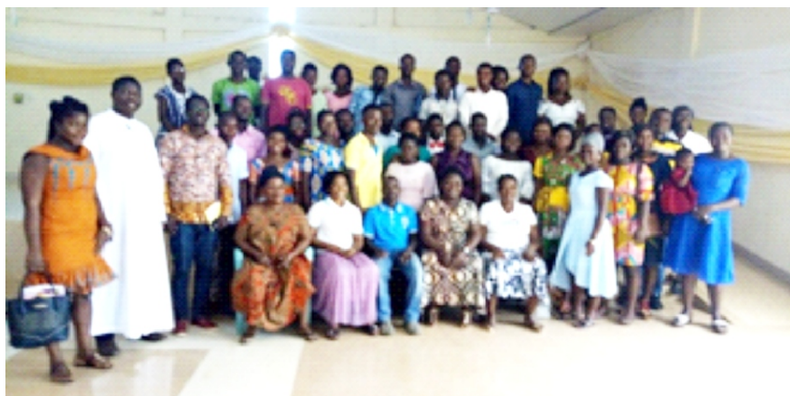
The PMS Director, Coordinator and Animators from various Parishes, Goaso Diocese.

Arch/Dioceses: The Clergy, Religious, Seminarians, Novices and Lay Catechists etc., who partly depend on this help through the Pontifical Society for the Propagation of the Faith. Please, kindly make sure that all proceeds are forwarded to your Arch/Diocesan Secretariats on time.