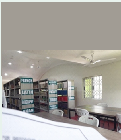
Society of St. Peter the Apostle helps St. Teresa's Seminary, Amisano