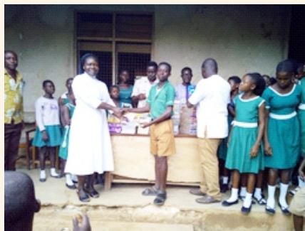
Children of Missionary Childhood making donation to deprived school.