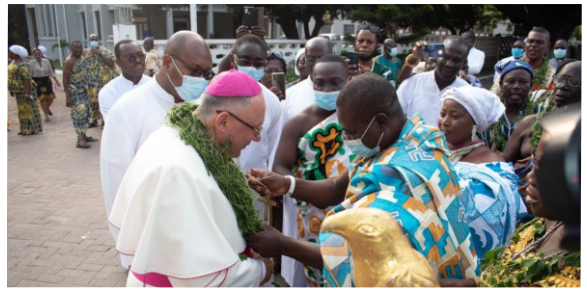
The Apostolic Nuncio's canonical visit to Archdiocese of Accra

The pope concluded, "Dear brothers and sisters who are part of the General Assembly of the PMS, I hope that you walk the path traced by this great missionary woman, allowing yourself to be inspired by her concrete faith, her audacious courage, her generous creativity. Through the intercession of the Virgin Mary, Star of Evangelization, I invoke the blessing of the Lord upon each one of you and I ask you, please, to pray for me."