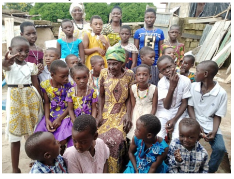
Navrongo-Bolgatanga Diocese - Missionary Children visit grandparents and elders